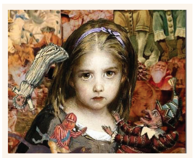
COMMON GROUND THEATRE COMPANY BRINGS THEIR RIOTOUS & THEATRICALLY INVENTIVE ADAPTATION OF